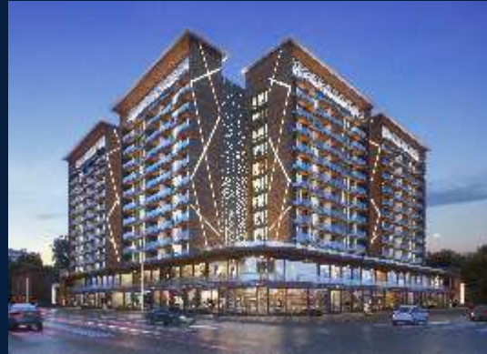
SHUBH GATEWAY, VIMAN NAGAR