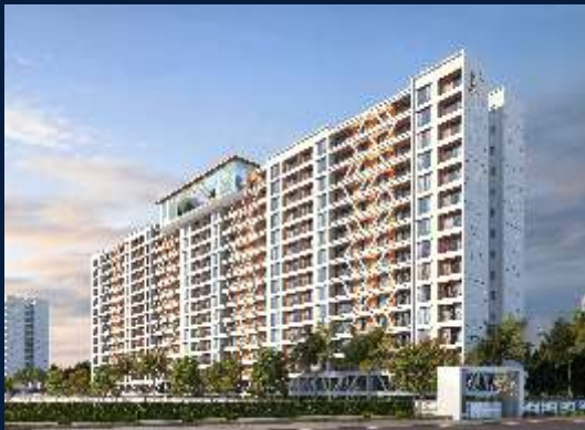
K CITY, KESHAV NAGAR