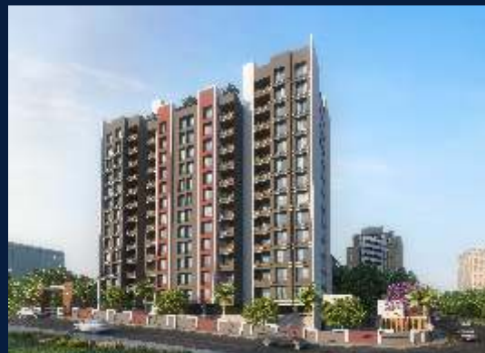
ELYSIA, KESHAV NAGAR