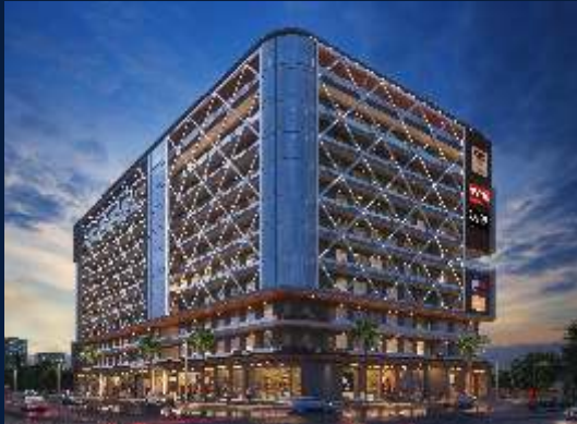
VASANTAM CITY CENTRE, DHANORI