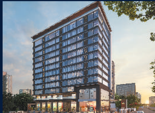
38 DIVINE, KONDHWA