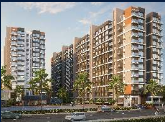
GOODWILL BREEZA, DHANORI