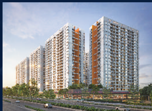
K PUNE, BAVDHAN