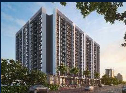
KOSMIC KOURTYARD, WAGHOLI